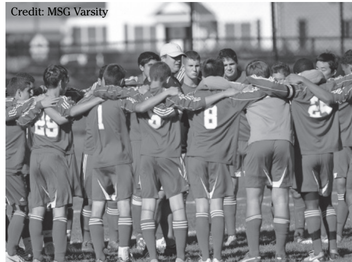
Varsity Boys Soccer huddles in between plays.