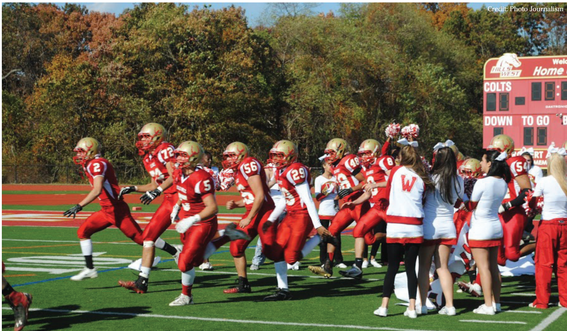
Varsity Football taking the field for their intense Homecoming game against West Babylon on October 26, 2013.

The Boys Varsity Football team has so far had an up and down season. They currently have a record of four wins and three losses, with one game remaining on the schedule. While many of their wins have been complete blowouts, all of their losses were very close games.